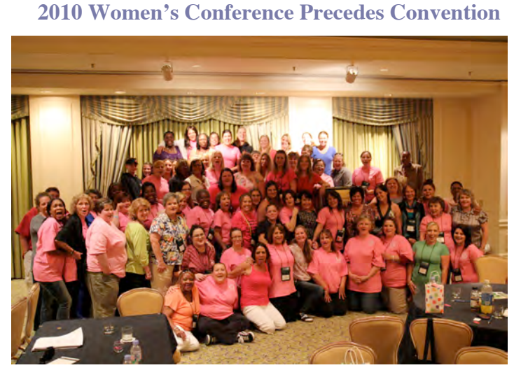
187 Women residents and alumni have a five- hour conference a day before convention.