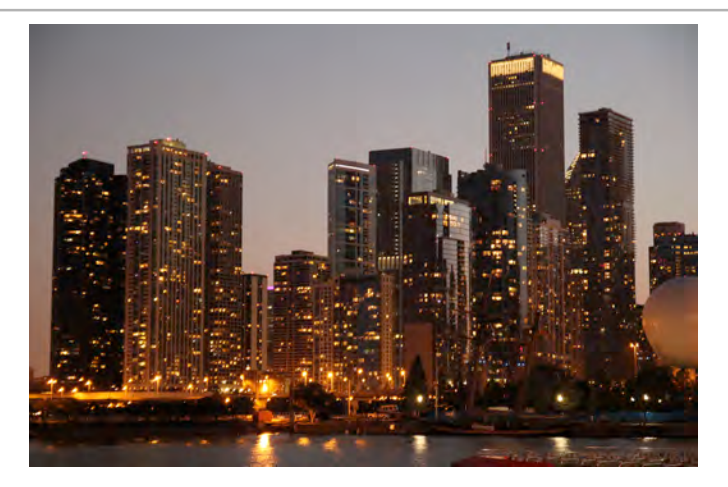
Chicago at dusk