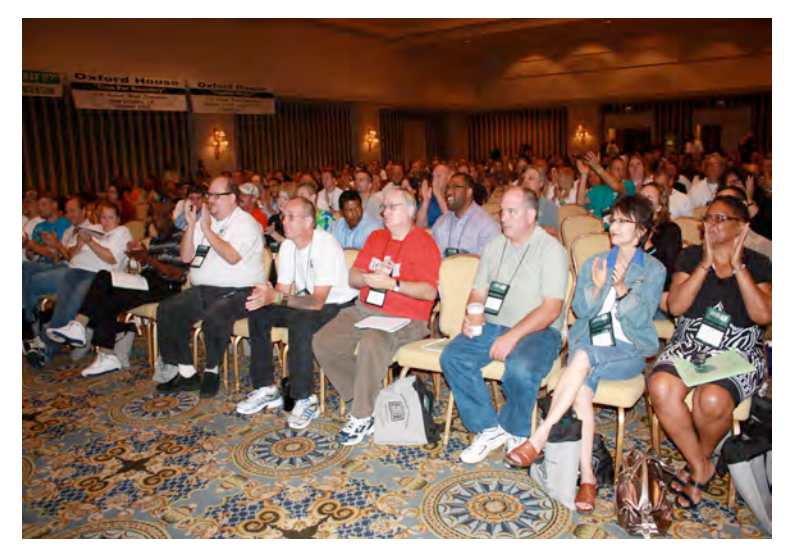
First General Session audience - part of the 710 Convention attendees