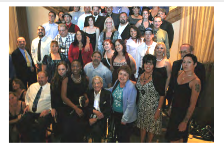
Washington State Delegation