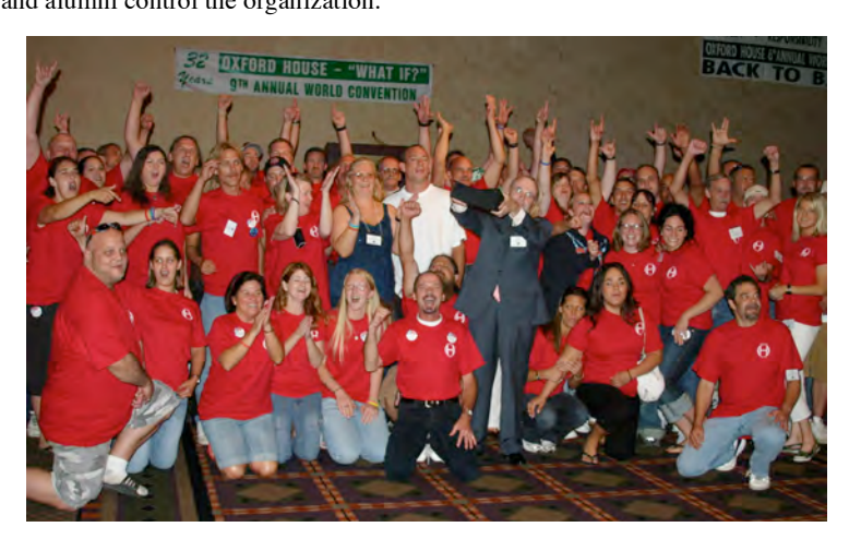
Washington State contributed more than $80,000 to expand Oxford House World Services in 2007

conventions adopted resolutions encouraging voluntary contributions as the best means for assuring that Oxford House residents and alumni control the organization.