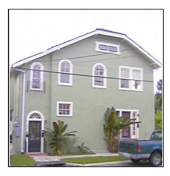
Oxford House-Uptown 8504 Freret Street New Orleans, LA 70118

Kenner, like Metairie and Mandeville, is in Jefferson Parish and only 10 miles from New Orleans. In January 2003 a house for 7 women was established in Kenner. During May 2005, it had three vacancies that suggest the lack of a sufficient number of houses in this large suburb of New Orleans. As discussed later in this evaluation, clusters of houses providing a critical mass of recovery beds is necessary to maximize full utilization of available recovery beds. For example, a treatment counselor who consistently finds no beds available when he or she tries to encourage a person leaving primary treatment to apply to an Oxford House soon gets discouraged and is reluctant to spend the time and effort to convince the next client to follow the same course. By having a sufficient number of houses in an area the chances of matching supply and demand for long-term recovery beds is increased.