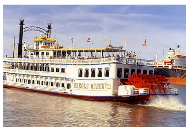
Friday night awards reception was held on the Creole Queen – a paddle wheeler on the Mississippi where all the Convention attendees enjoyed jazz and great food. The Convention theme "Time for Recovery" underscored the determination of all Oxford Houses to establish enough Oxford Houses so that recovery without relapse becomes the norm – not the exception.

Meanwhile, the Oxford House in Louisiana worked together to rebuild the Louisiana Network of Oxford Houses. As a matter of fact at the next national convention Louisiana Oxford Houses presented a persuasive pitch to have the 2008 Annual Convention in New Orleans. The Convention was scheduled for September 3, 2008. Once again a hurricane tried to thwart the determination of the Louisiana Oxford Houses, but once again it failed. Hurricane Gustav did cause the Convention to be rescheduled but two months later – October 30 – November 2 – found more than 560 residents and alumni in New Orleans for the 10<sup>th</sup> Annual World Convention at the New Orleans Hilton Riverside in New Orleans.