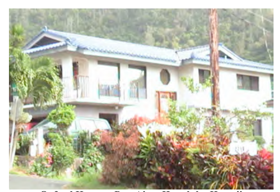
Oxford House – Puu Aina, Honolulu, Hawaii 10 Men Established December 2002

Officers carry out their meeting duties by following a very structured format. The Secretary records meeting activities and reports past meeting activity using a standard form and format. The Treasurer reports income and outgo using standard reporting forms and the Coordinator does likewise. Other rituals include the reading of one of the nine Oxford House Traditions at the beginning of each meeting and the Serenity Prayer at the end of each meeting.