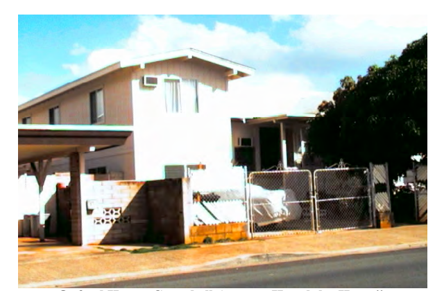
Oxford House-Campbell Avenue, Honolulu, Hawaii 11 Men; Established April 2004

Moreover, the group places behavior expectations on all residents to do chores, carry out responsibilities of office, and to offer recovery support to each other and to live as