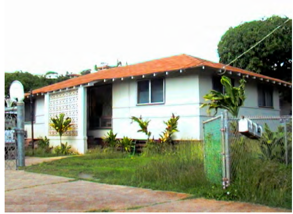
Oxford House-Noeau, Honolulu, Hawaii 8 Men; Established May 2004

availability of public assistance contributes to the low employment percentage among Hawaii Oxford House residents. Intuitive Oxford House experience suggests that while public assistance is helpful for the newly recovering individual to be able to move into an Oxford House, it may discourage return or entry to the workforce.