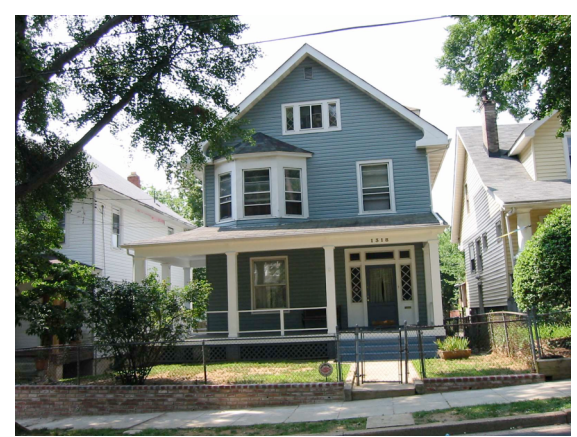
Oxford House-Kalorama 1318 Delafield Place, NW Washington, DC 20011

and sober without relapse. Since sobriety is habit forming, it safe to project that most Oxford House residents in DC have successfully achieved long-term sobriety.