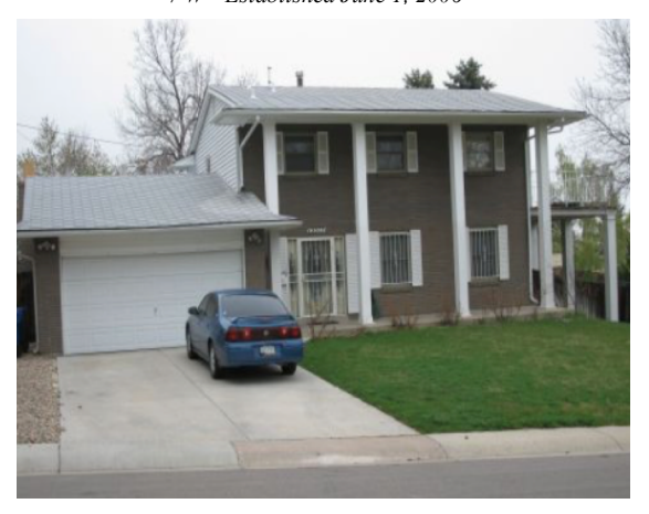
Oxford House - Green Mountain 11900 W Alameda Avenue Lakewood, CO 80228 6 Women • Established March 1, 2002