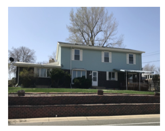
Oxford House - Synergy 5716 W 66th Ave. Arvada, CO 80003 10 W/C • Established May 1, 2018

Long-term behavior change is the most difficult to achieve because behavior change – always difficult – becomes nearly impossible if the individual returns to a living environment identical or similar to where he or she was living as an active alcoholic or drug addict.<sup>6</sup>