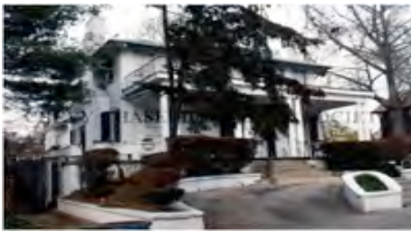
NORTHAMPTON HOUSE (APPROX 1977)

Oxford House – Northampton is the oldest existing Oxford House. It opened in 1977. This house has and continues to have a major impact on the community. This house is Northampton House, situated just south of Chevy Chase Circle, Washington DC.