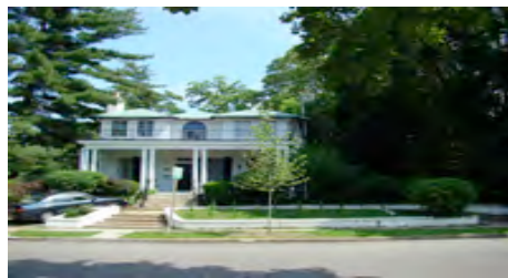
NORTHAMPTON HOUSE (2009)